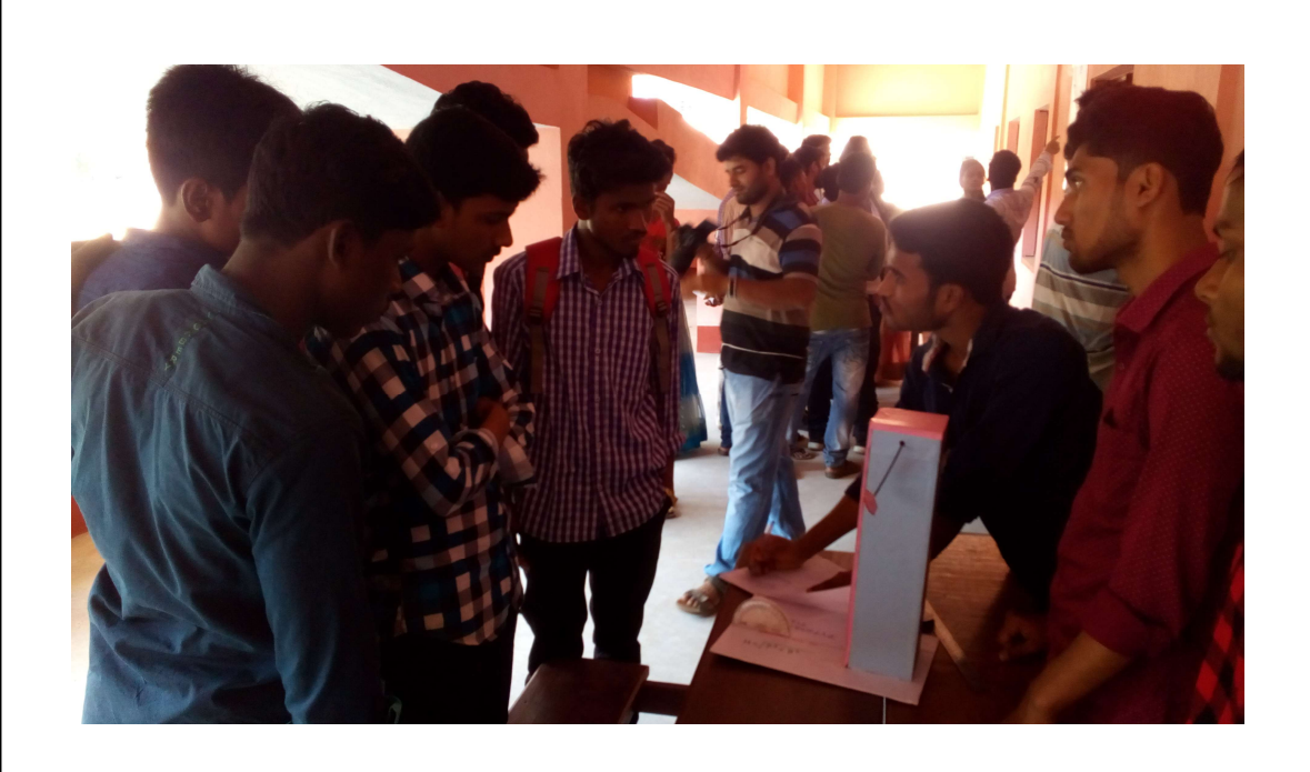
Science Students are showing experiments to other departmental students