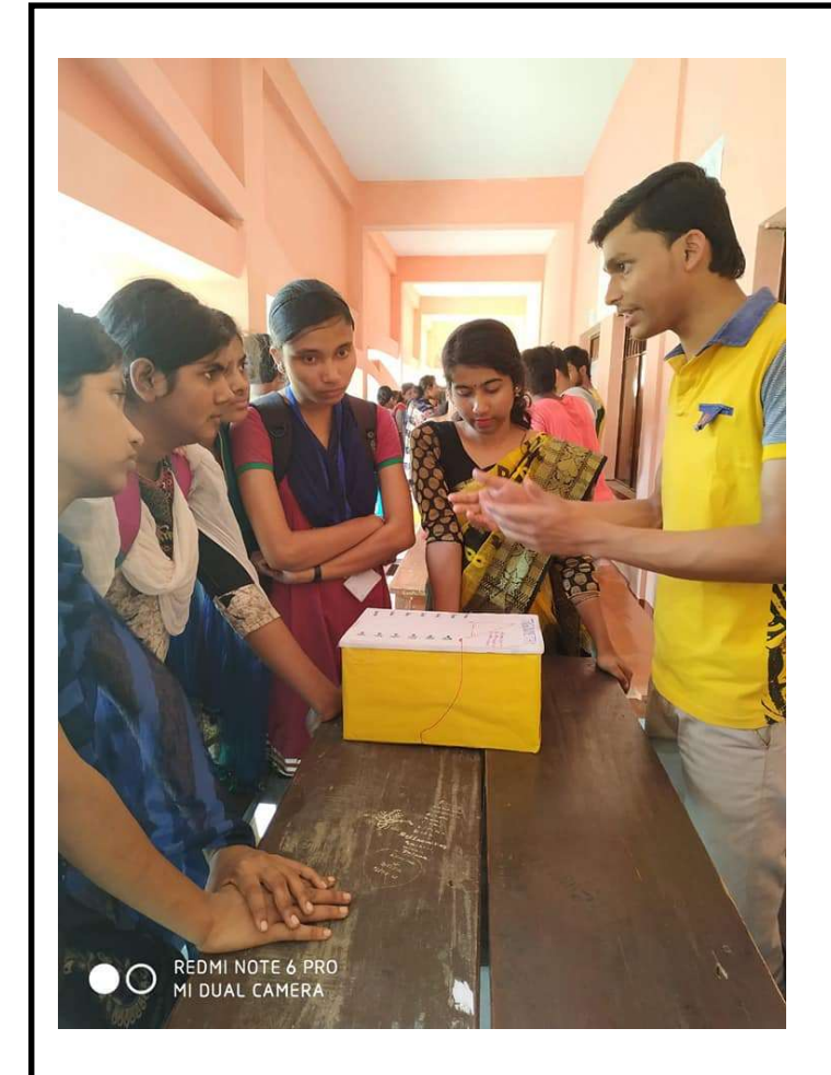
B.Sc. Students are showing experiments to other departmental students