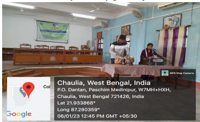
Students are performing in Singing Competition.